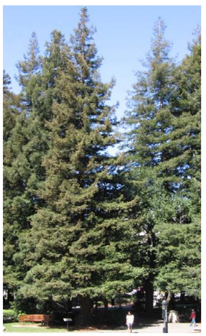
Redwoods on campus at UC Berkeley.

Taxodiaceae may outperform the Pinaceae the at elevated CO<sub>2</sub> levels that are consistent with the strong presence of the Taxodiaceae in the earth's flora during the Eocene. Although we cannot make the assumption that extant species are equivalent representatives of their possibly extinct ancestors, it does appear that in large part, the physiology of the Taxodiaceae may have been conserved. Some components of this project will be performed in collaboration with Dr.